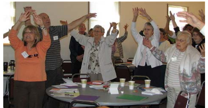
CTA-MI members participate in the final prayer, energized and ready to build God's kingdom.

With heartfelt gratitude, Call To Action-Michigan gives you this award. On the 19 th day of September, 2009.